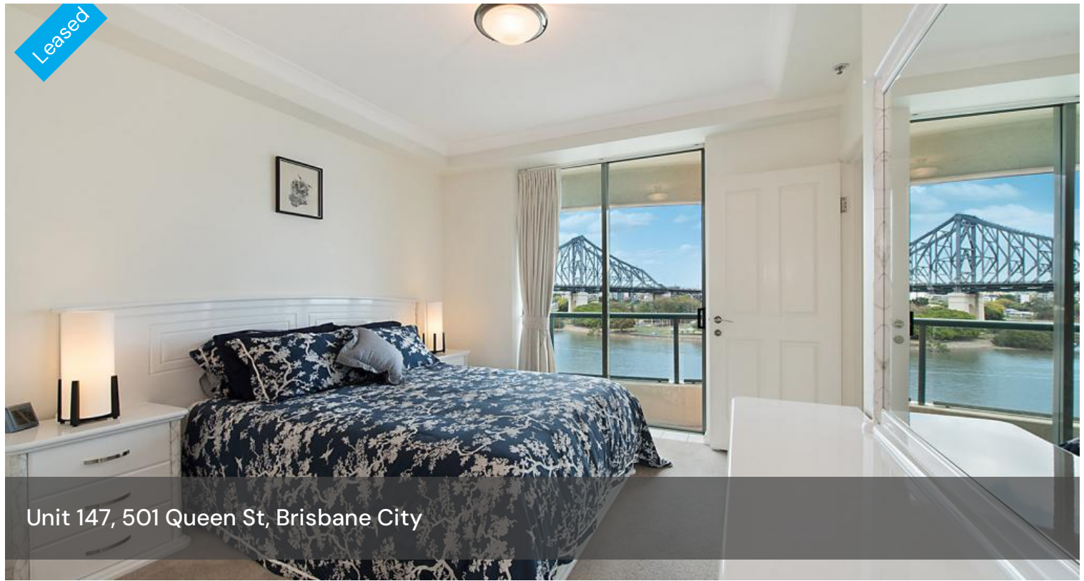
Unit 147, 501 Queen St, Brisbane City