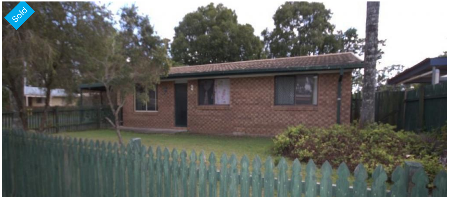
2 Tanya Court, Eagleby